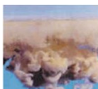
1.5 seconds later