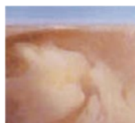
3 seconds later

Polyram DF is registered to control fungal diseases in a range of horticulture and broadacre crops including: